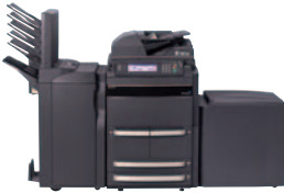
Shown with optional 4,000 Sheet Adjustable LCT, 3,000 Sheet Finisher with Multi-Tray and Booklet Folder