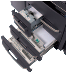
Standard paper capacity of the CS 820 is an impressive 4,150 sheets, featuring dual 1,500 Sheet Letter Decks and dual 525 Sheet Adjustable Paper Drawers