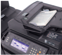
The CS 820 comes standard with a productive Dual Scan Document Processor (maximum capacity of 260 sheets)