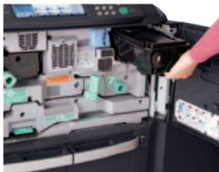
The CS 820 features High Capacity Toner rated for 55,000 pages (6%). Replacing toner containers is a simple task for any user.